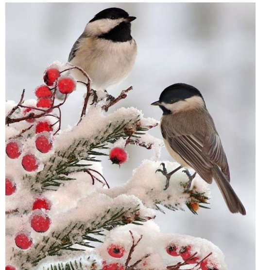
BLACK CAPPED CHICKADEES

February 18, Friday – PIA Program: Zoom Meeting (See Page 3)