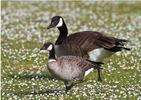
CAKCLING GOOSE VS CANADA GOOSE

Cackling Goose 1; Jan. 5; Edinboro Lake; D.S.