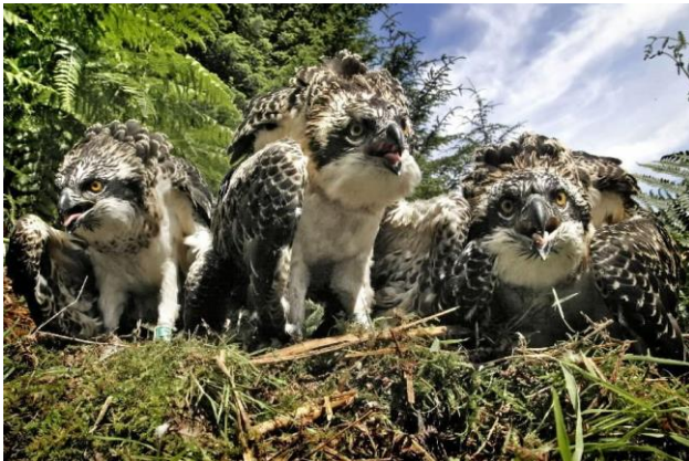
NEWLY FLEDGED OSPREY

Osprey; 4 nearly fledged young in a nest; July 17; Waterford; fide J.H. 3; young in a nest; July 17; Union City; J.H.