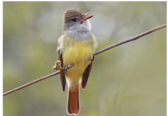
Great Crested Flycatcher

Solar for Schools (HB 1082) passed in the PA legislature and was signed into law by Gov. Shapiro on July 17. Grants can now be issued to school districts, intermediate units, career and technical schools and community colleges to purchase and install solar energy equipment. Big win for birds, which are decreasing in numbers due to climate change caused by burning fossil fuels. Here's how our local legislators in Erie and Crawford Counties voted: (Cont. on Page 2)