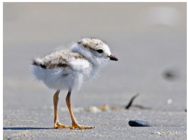
Piping Plover Chick

The Erie Bird Observatory and its partners were happy to see them set up shop in a very high, dry and secure location, far from the high waters the park experienced this season.