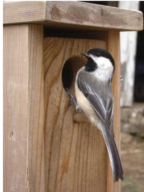
Chickadee Checking out a New Home