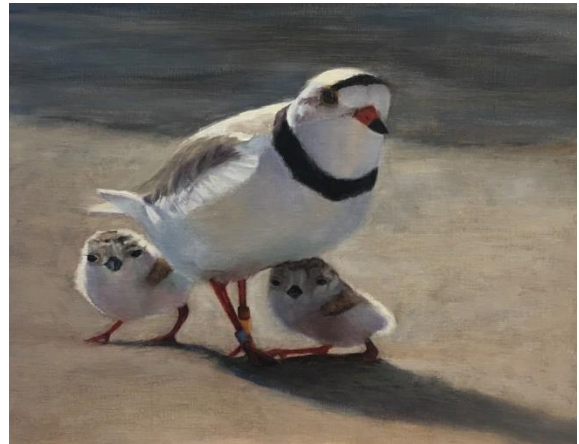
PIPING PLOVER WITH YOUNG

Piping Plover —up to 4; through the period; Gull Point; M.B.