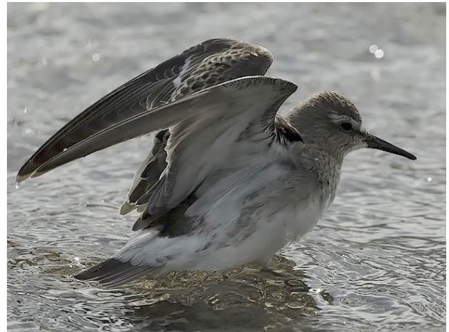
WHITE RUMPED SANDPIPER

White-rumped Sandpiper—1; June 20; Gull Point; M.B. 2; June 24; Gull Point; M.B.