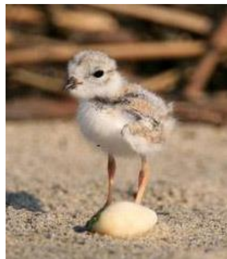
PIPING PLOVER CHICK