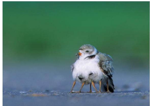
ONE PIPING PLOVER WITH 6 LEGS!