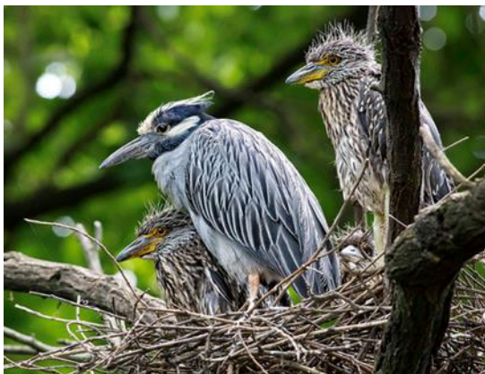
YELLOW-CROWNED NIGHT HERON W/ YOUNG

Yellow-crowned Night-Heron —1 imm.; July 2; Gull Point Trail; M.B.. First July record in the county and only the second summer record.