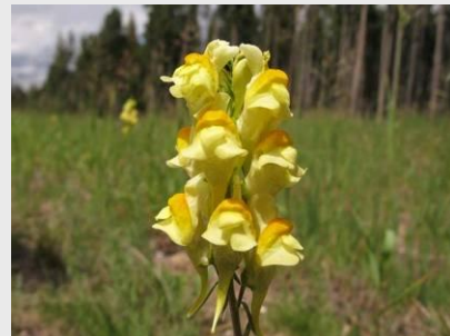
Butter and Eggs

September 27, Tuesday - First Meeting of the Festival of the Birds Committee at 6:00 PM in the TREC Board Room